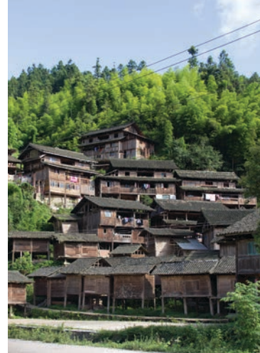
Houses around a pond; granaries and houses rising from the river to a hill.

is another bridge, as narrow as the second one. Two more bridges connect the two sides of the river before the river flows past the village. The bridges are covered with an roof and are lined with benches along its sides, providing a refuge from the elements to the passersby.